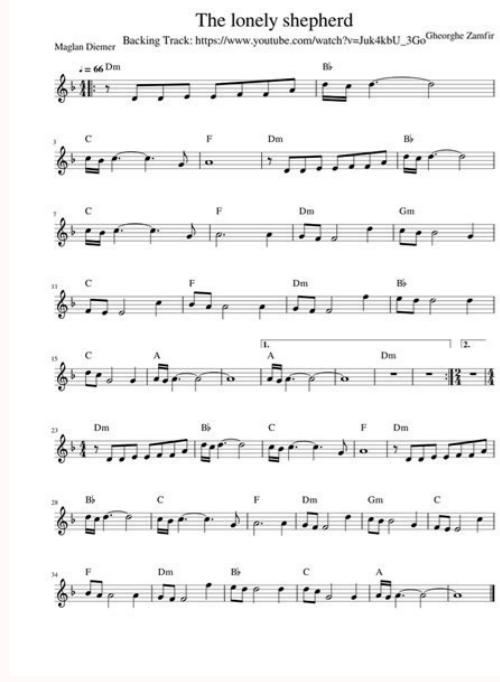
Piano sheet music explained. The lonely shepherd sheet music piano. Piano sheet music storage ideas. The lonely shepherd easy piano tutorial (synthesia/sheet music).